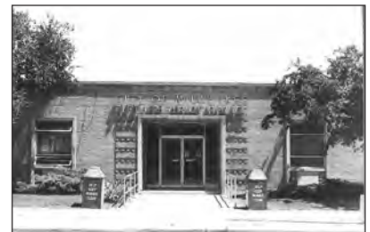
District Five 2920 North 4th Street, Milwaukee, WI 53212

of their investigations. During 2007, the intelligence gathering and analysis took place, which resulted in the location selected. Several months of undercover operations took place, which identified street level dealers within the Harambee North area. Numerous community meetings have taken place and will continue well into to the next year.