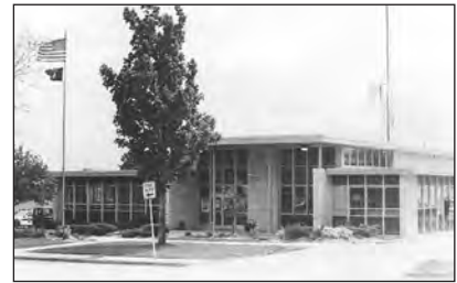
District Four 6929 W. Silver Spring Dr., Milwaukee, WI 53218

During the year, District Four was actively involved in city's Common Ground Initiative that operates in the form of a consensus-building and action-oriented project, designed to address critical issues for improving and sustaining public safety, and also, a desirable quality of life for city residents.