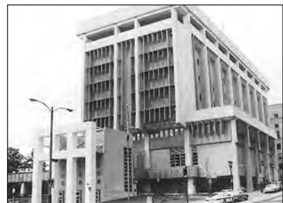
District One / Police Administration Building

The "new" District One was launched in November 2007. This major change more than doubled the territory and greatly increased the residential population of the District. Expansion also enlarged the mission of the District One, offering new challenges to our officers. The new district boundaries have necessitated the formation of a School Squad, an Anti-Gang Unit and a Tavern Enforcement Unit.